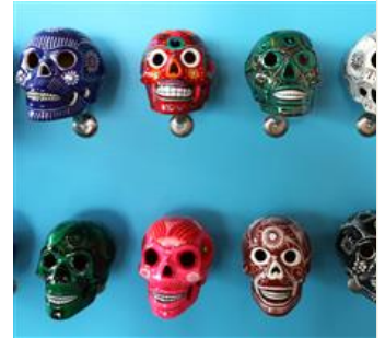
Three new Bartolotta restaurants in Tosa