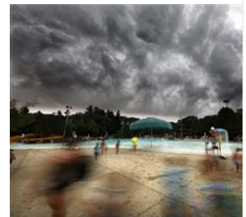
MyCommunity NOW photos of the week: July 22, 2016