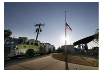
First Responder Fest