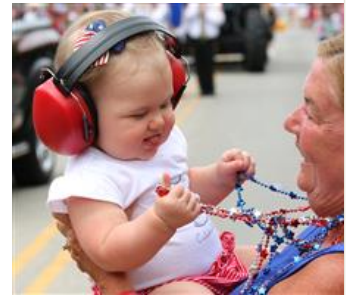
MyCommunity NOW photos of the week: July 8, 2016