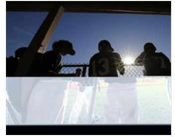
Baseball: Wauwatosa East vs. Wauwatosa West