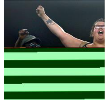
Protest in Wauwatosa stems from officer-involved shooting