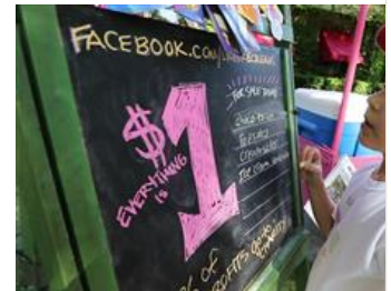
Lili's Ice Cream Stand benefits Hunger Task Force

100%;height:100%;overflow:hidden;} .photo_grid .prev{text-indent:-1000px;background:url("http://media.mycommunitynow.com/d no-repeat scroll 0 0 transparent;cursor: pointer;float: left;height: 19px;padding: 0;margin: 0;width: 19px;display:block;} .photo_grid .count{float: left;margin:0 5px;display:block;} .photo_grid .next{text-indent:-1000px;background: url("http://media.mycommunitynow.com/d no-repeat scroll 0 0 transparent;cursor: pointer;float: left;height: 19px;padding: 0;margin: 0;width: 19px;display:block;}